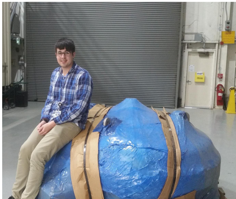
The Phase 2 inner vessel just arrived